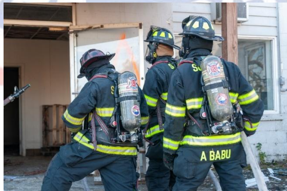
Live Fire Training at South Hills Country Club hosted by Caledonia FD

Respectfully Submitted, Training Captain Aaron Strom