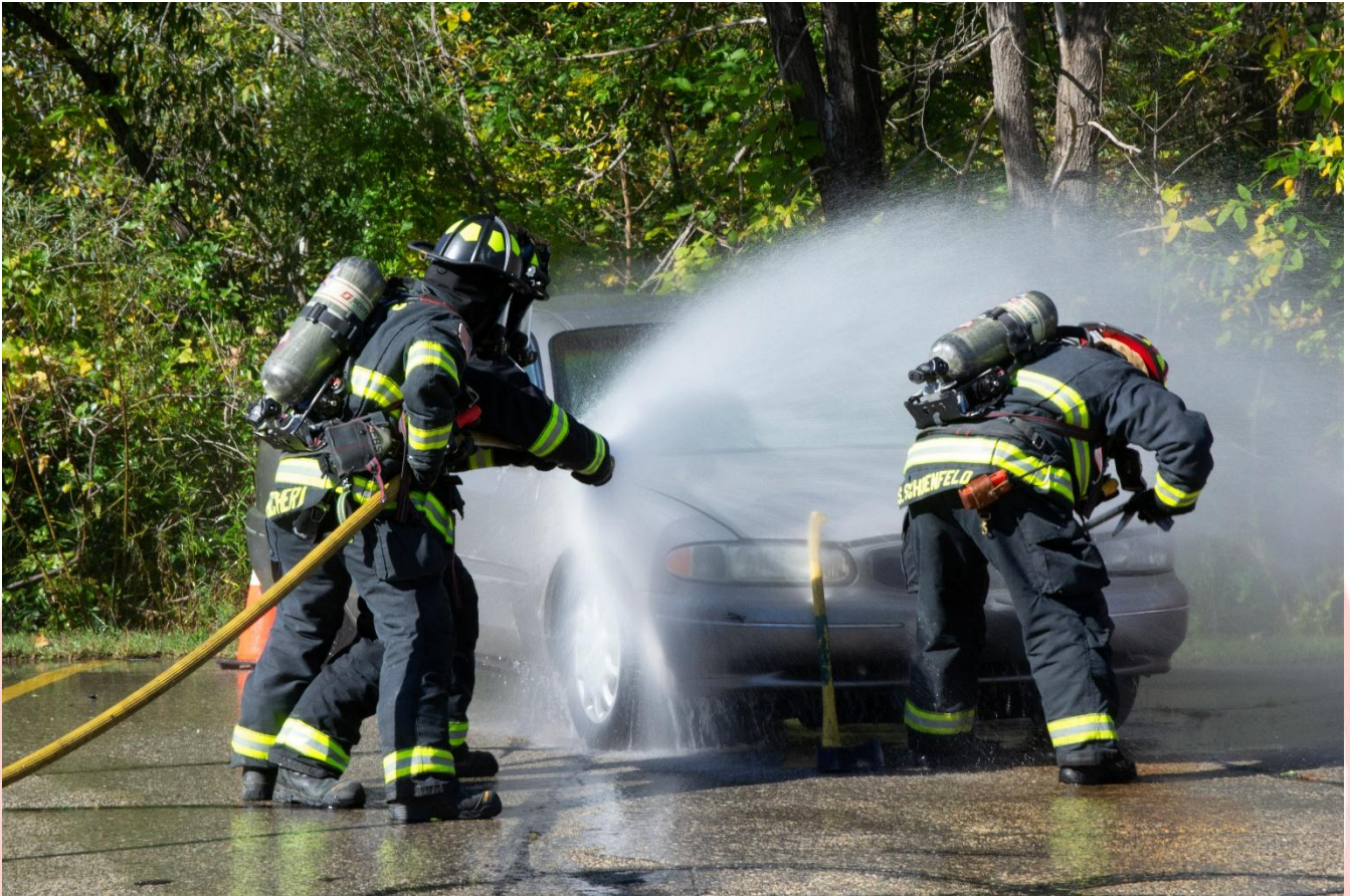
Simulated Car Fire Training at Station 2