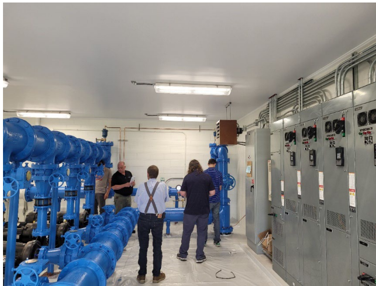
DNR Inspection of Water Transfer